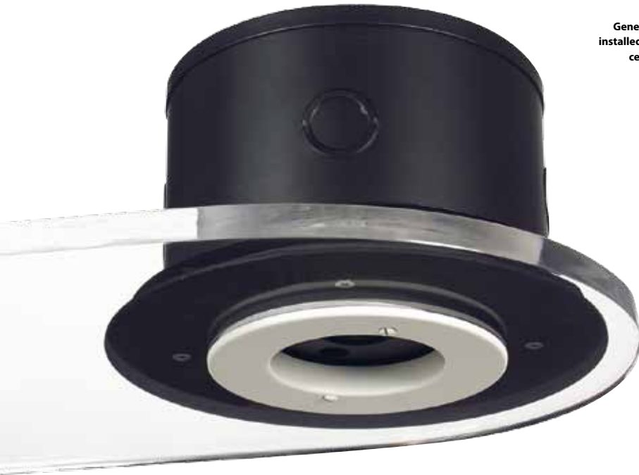
Genee Air installed in a ceiling